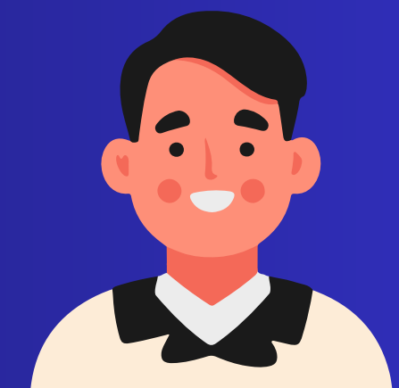
Position Vacant Volunteer Coordinator Spain & Portugal