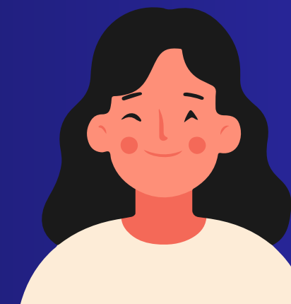
Position Vacant Finance Manager Europe & US