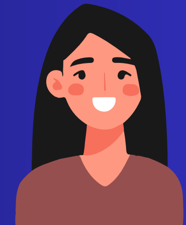
Position Vacant Finance Manager Europe