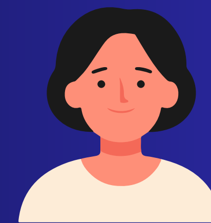
Position Vacant Volunteer Coordinator Germany