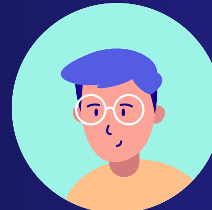
Position Vacant Church Planter