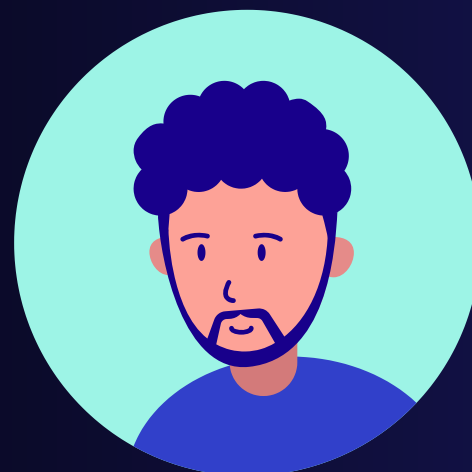
Position Vacant Volunteer Coordinator France