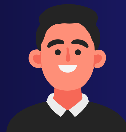
Position Vacant Volunteer Coordinator Italy