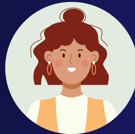
Position Vacant Outreach Mission Advisor