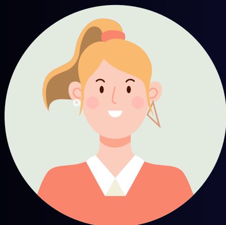
Position Vacant Volunteer Coordinator Poland