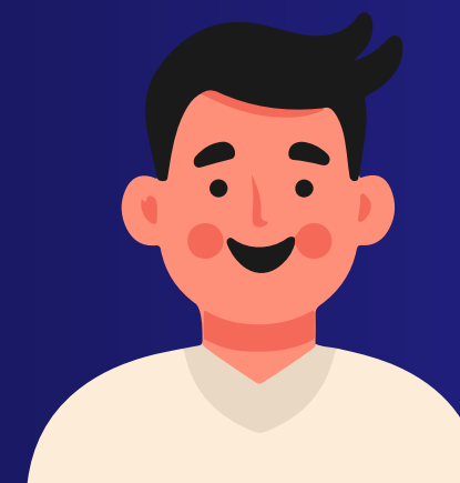
Position Vacant Volunteer Coordinator The Netherlands