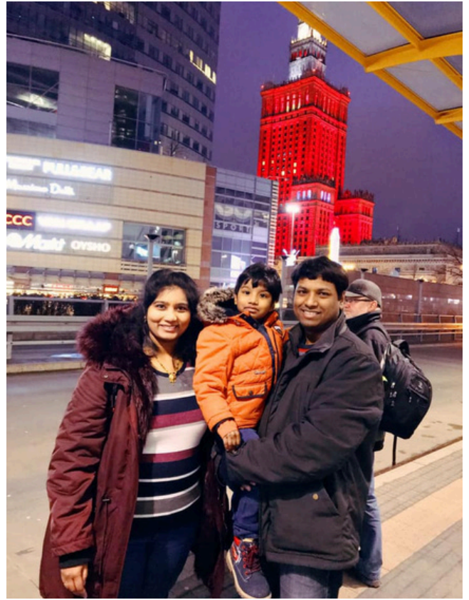
Photo: Near Warsaw Central Station & Palace of Culture & Science