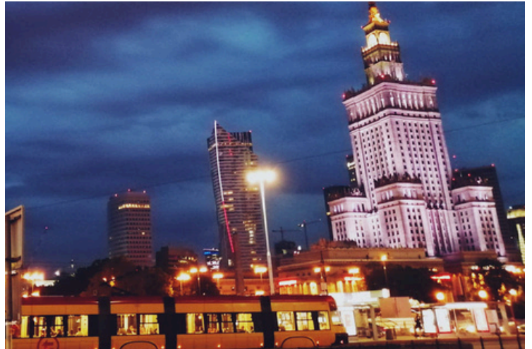
Photo: Picture taken during Covid-19 of Warsaw Palace of Culture & Science