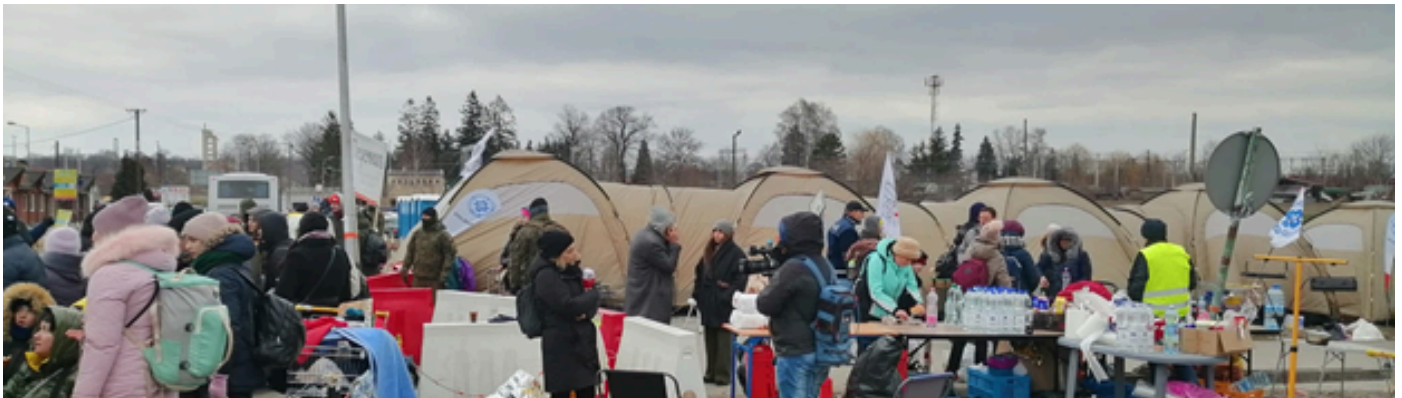
A Photo taken by Emmanuel on his visit to the Medyka border to help Ukrainian refugees find hope, help and security.

In February 2022, the world watched in horror as war erupted between Russia and Ukraine. Millions of lives were uprooted overnight. Poland became a safe corridor for refugees fleeing violence, with over 1.5 million Ukrainians crossing the border within the first few weeks.