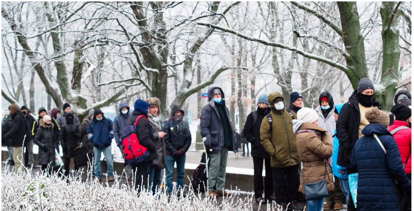
Photo: City Church Warsaw and the Smile Warsaw serving the homeless community every Sundays

That is when the word “Community” took on new meaning to explain what life really means. It became a spiritual necessity, a place of healing and belongingness. This revelation birthed a vision to plant and support churches that are not just places of worship, but homes of hope, where discipleship and real relationships flourish.